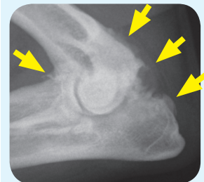
Arthritic elbow joint in a dog with lots of "fluffy" new bone (yellow arrows) around the joint, indicative of marked arthritis.