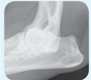
X-ray of a normal elbow joint

Radiography is commonly used to investigate joint problems.